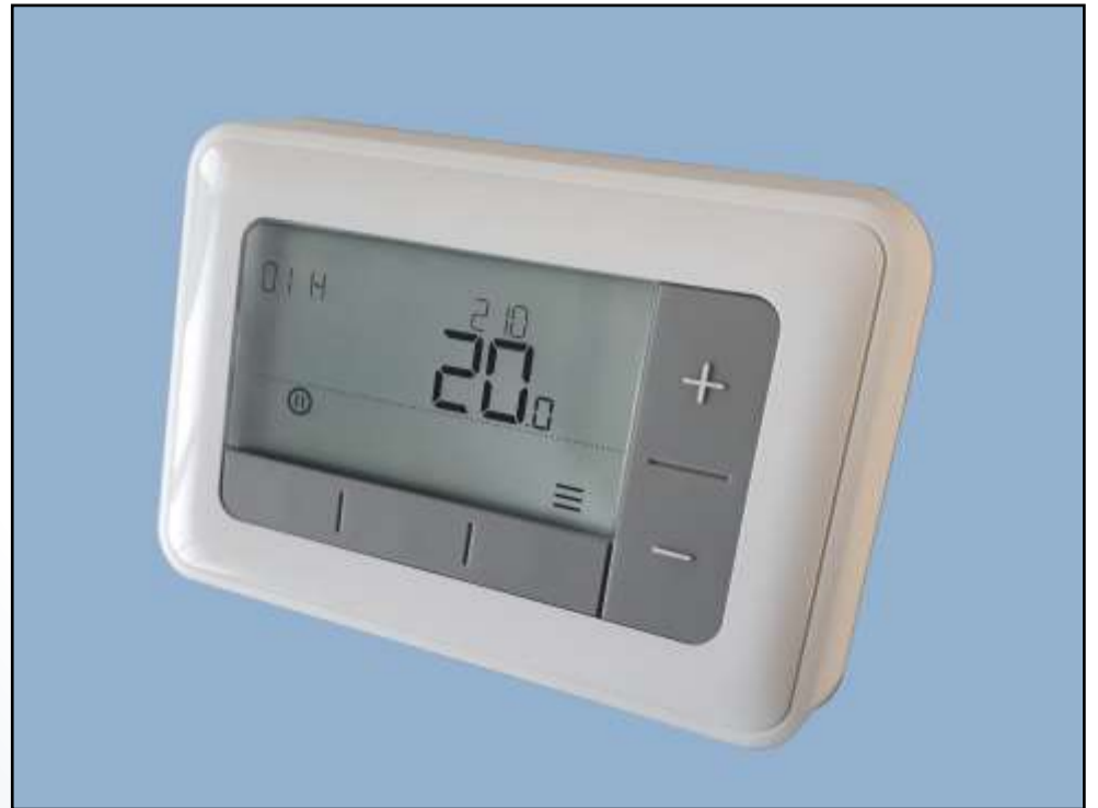
Remote programmable thermostat and timeclock.

DN20 (3/4" BSP) isolating ball valves complete with ground faced unions or gate valves can be fitted external to the casework, directly to the flow and return connections of the heating coil.