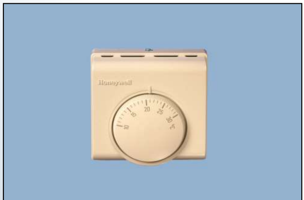
Remote on/off or high/low fan speed thermostat.