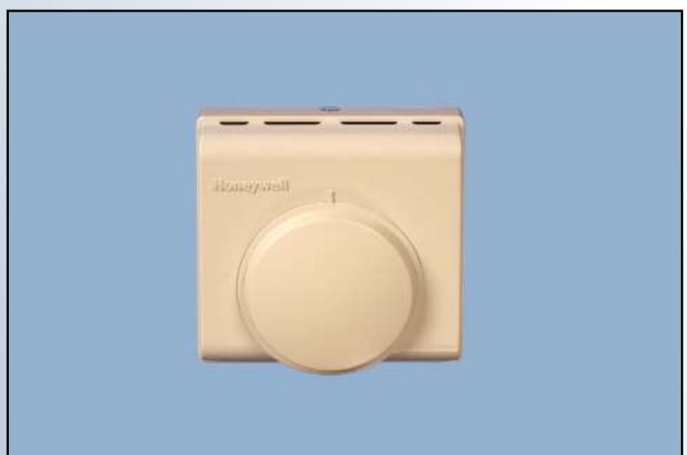
Tamperproof on/off or high/low speed thermostat